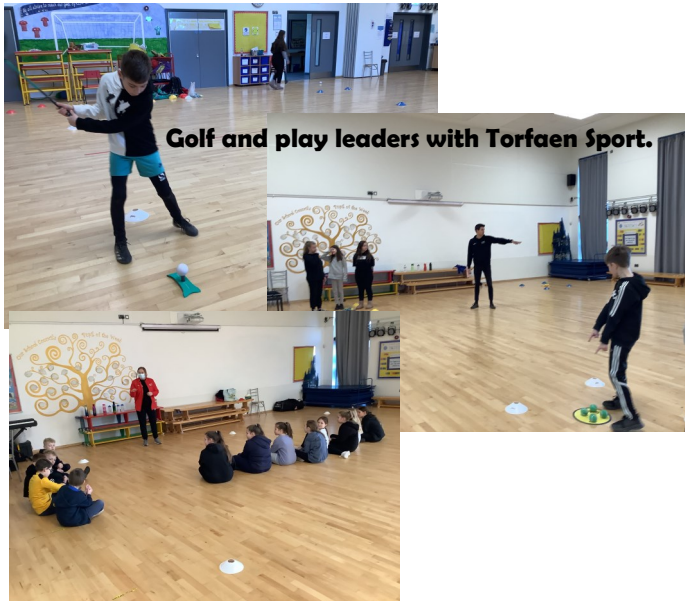
Golf and play leaders with Torfaen Sport.

The Right of the Month – To have your say and be listened to SEAL Topic – Going for Goals